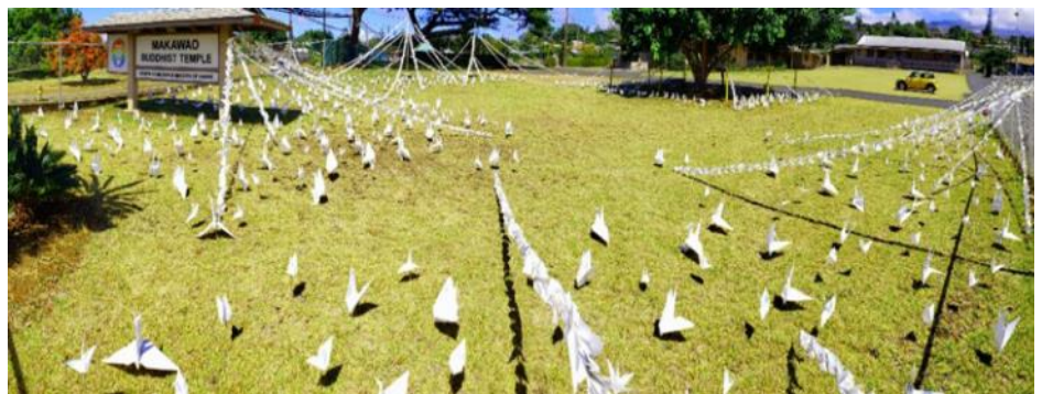
Nearly 3,000 Origami Cranes Send Messages of Healing and Peace