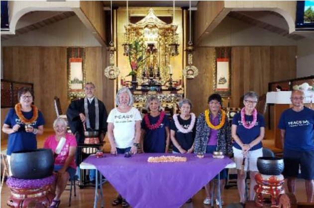
Ring Your Bells for Peace Day