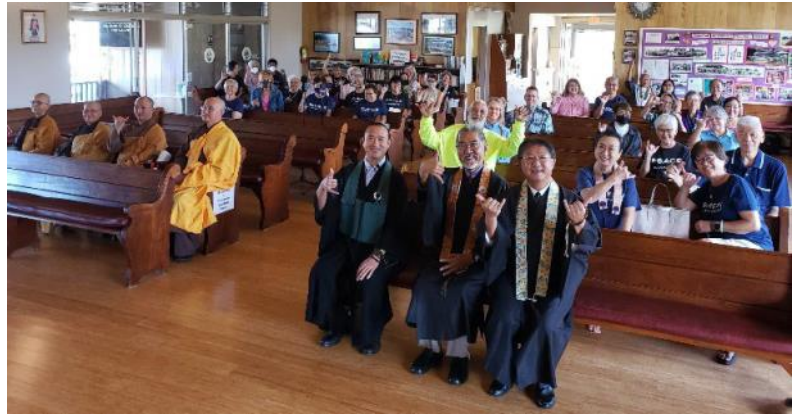
Peace Day Special Service

On Thursday September 21, 2023, we joined the Zoom version of the Ring Your Bells for Peace Day event along with hundreds of others from around Hawaii, the mainland USA, and Canada.