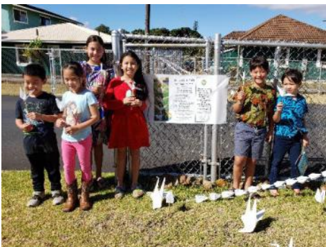
Dharma School Students

MAHALO to everyone who participated in this year's Peace Day activities!!