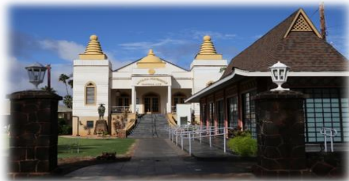
Lahaina Hongwanji before engulfed by fire.

Mahalo for your generosity and support during this time of tragedy.