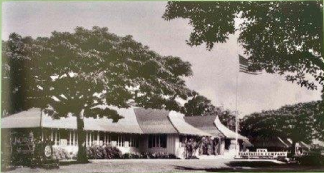
CANE TASSELS, WORK WHISTLES AND LABOR DAY CARNIVALS Memories of Ewa Plantation Town in the Mid-1900s