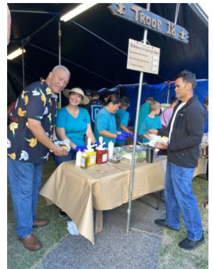
Mayor Bissen buys Troop 18 hamburger.