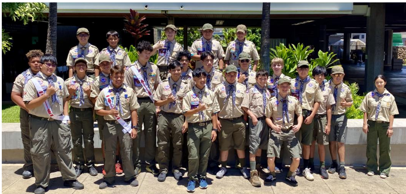
Going to National Jamboree in West Virginia!