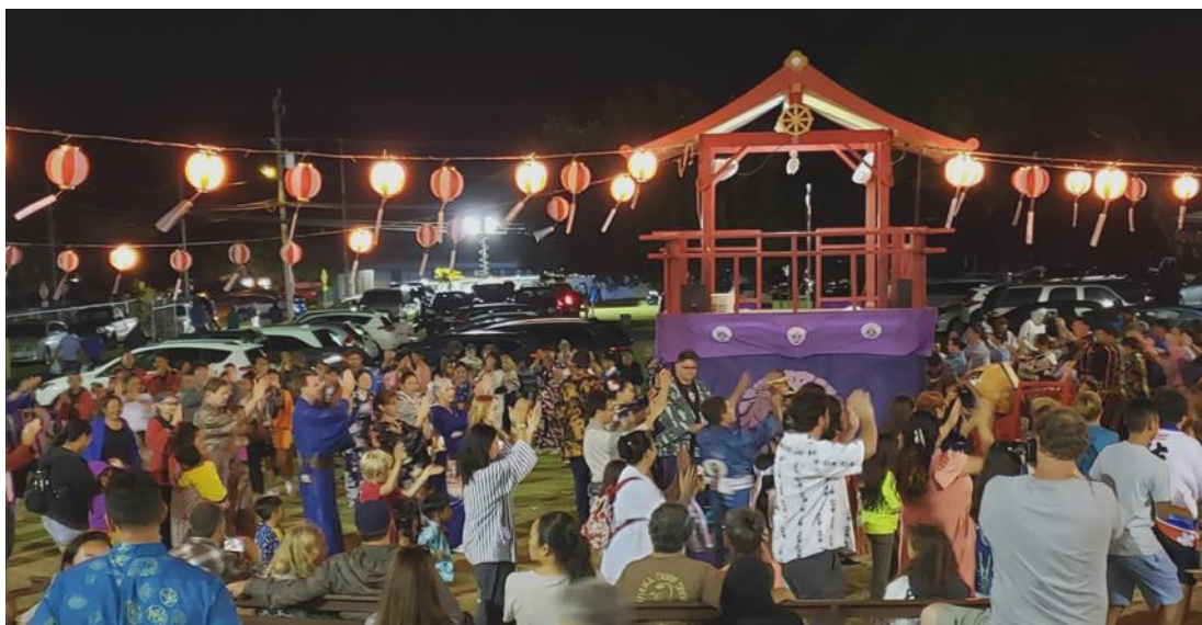
Dancing, dancing, dancing at Obon Saturday Night