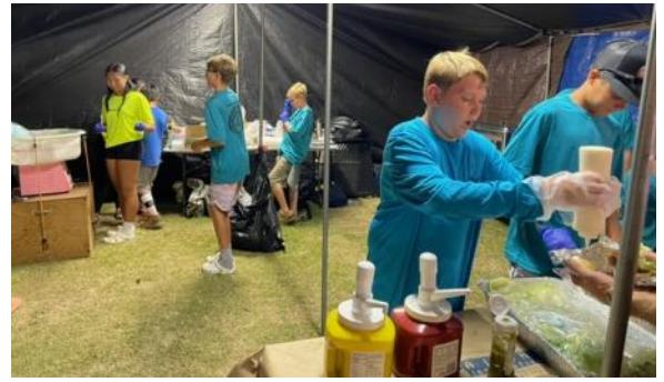
Boy Scouts make great burgers!