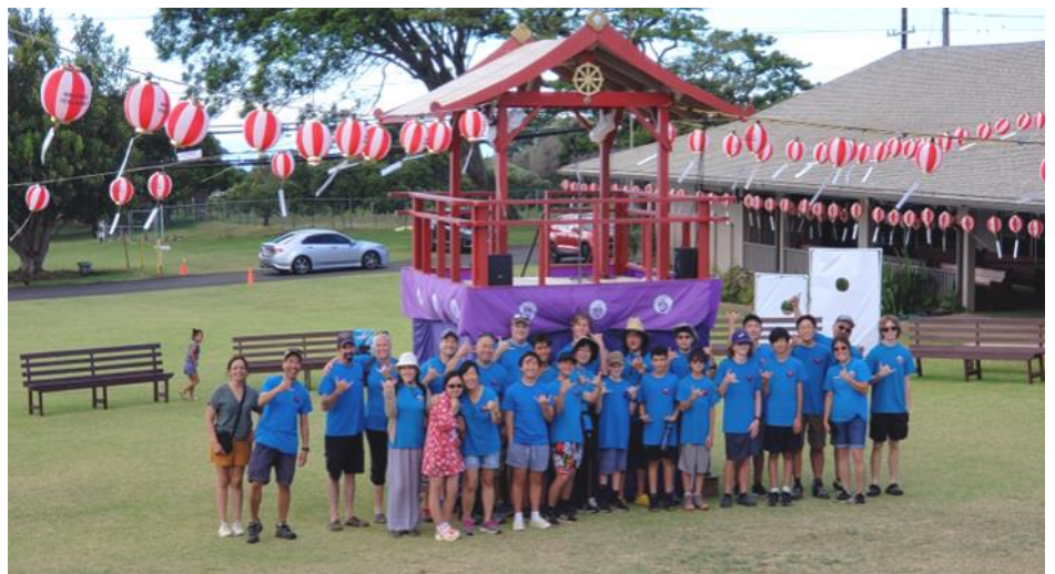
BSA Troop 719 of Torrance CA.