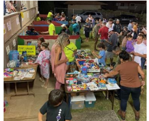
Cub Scouts working hard at game booths.