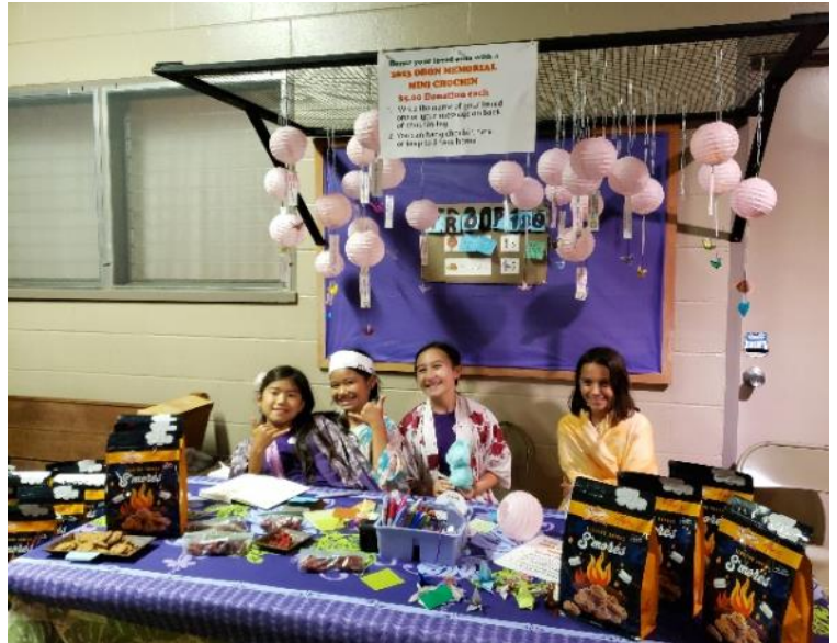
All Girls BSA Troop 180 of Makawao sell Memorial Chochins