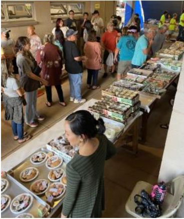
Breezeway goodies sell out both Obon nights.