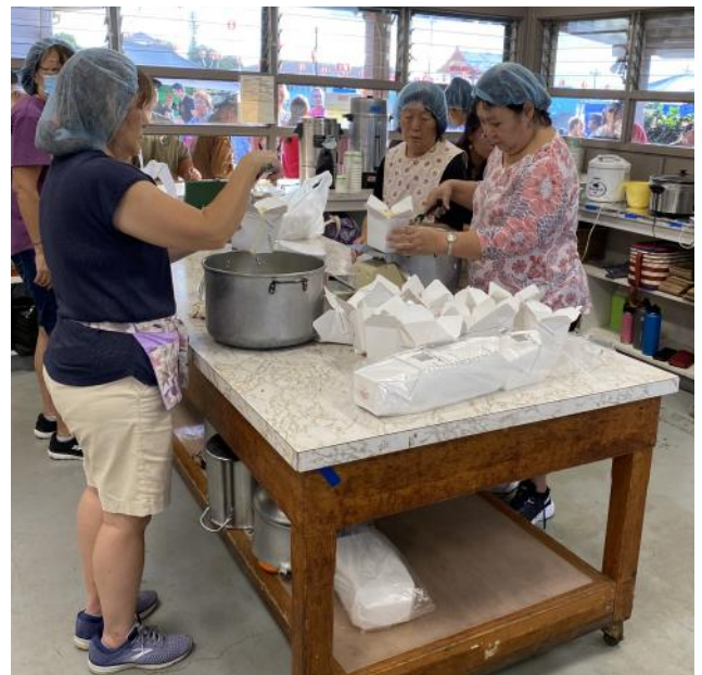
Chow fun ladies busy packing chow fun containers.