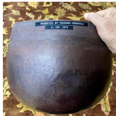
Lanai Hongwanji still using the 'daikin' gong given to them by Makawao Hongwanji in 1972.