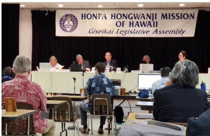
Working session of Legislative Assembly

The Aloha Luncheon for 48 th Living Treasures of Hawaii Recognition Program was held at the Hilton Hawaiian Village hotel and was attended by Makawao's in person representatives.