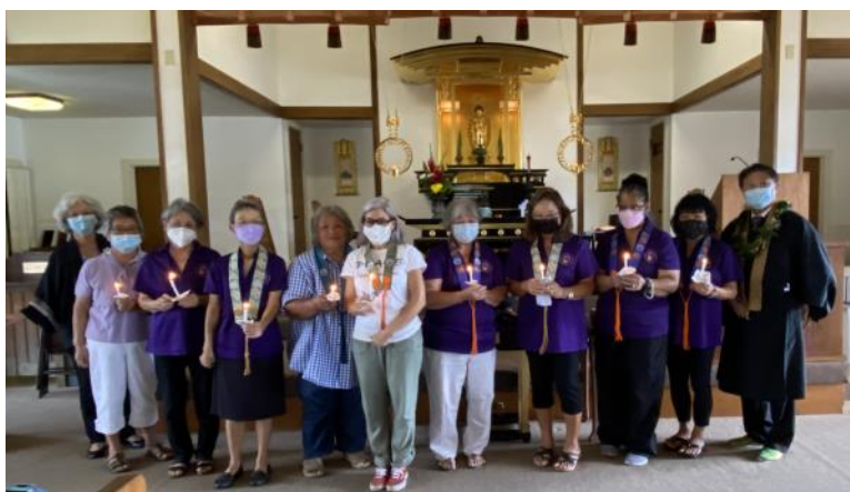
Installation of officers for MUBWA 2023.