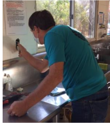
Checking and cleaning outlets.