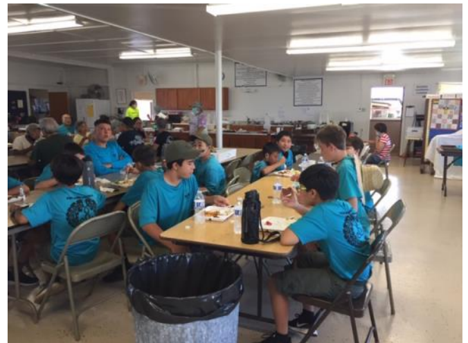
And then we eat!