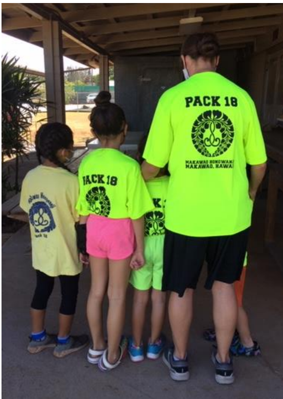
Pack 18 well represented.