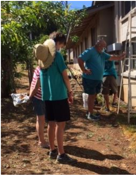
Boy Scouts hard at work.